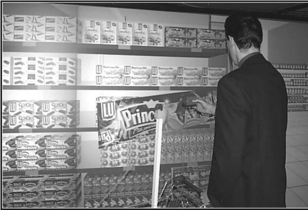
Figure 3. Virtual store for IN VIVO, designed and produced by the Ecole des Mines ParisTech and by the company Sim Team

The useful VBPs are determined on the basis of the I2f indicated in the FTR. For example, with regard to the virtual store for analyzing buying behavior [3], we determine 3 fundamental VBPs: the observation of the product / three dimensional handling and the spatial orientation of the product / observation of the products on the shelf. We therefore also define 2 secondary VBPs: the ease with which the customer moves and orients in the virtual store (VE) / the possibility of the customer picking up a product and then putting it back on the shelf or in the trolley.